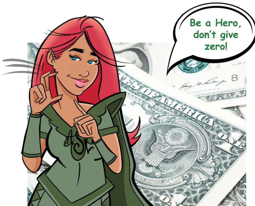
Introducing: Champ Girl!